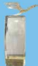
Lufthansa Airlines Award